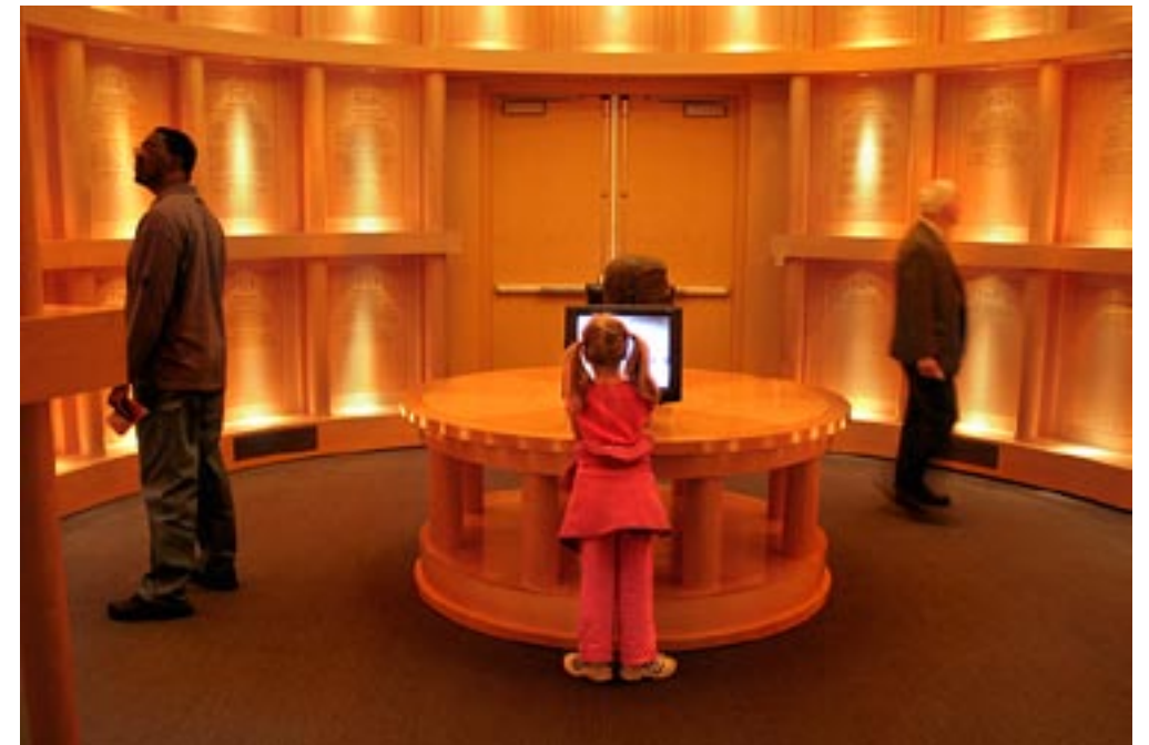
Hall of Fame

Wright State: http://www.wright.edu/artgalleries/photonow/home.htm